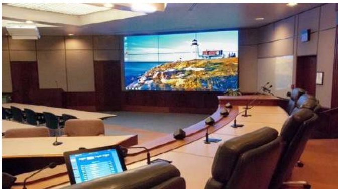
Advanced AV Setup