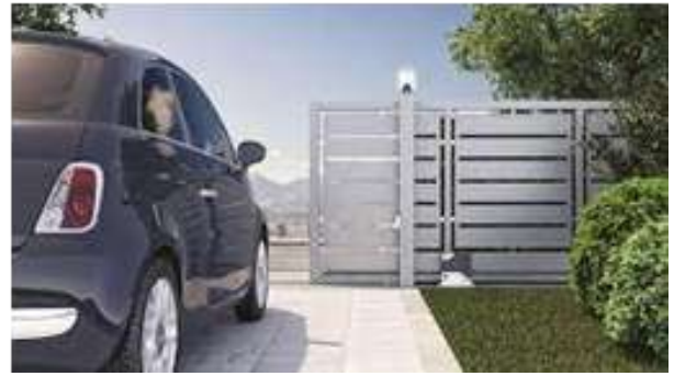
Sliding Gate Motors